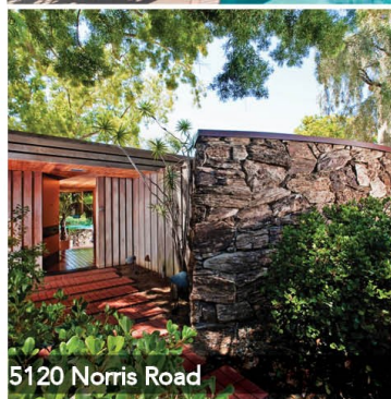
5120 Norris Road