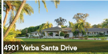
4901 Yerba Santa Drive