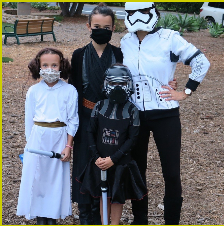
The Mullen Family dressed up in Star Wars

Special thanks to Angela Adu-Badu for making treat bags for all the kids!