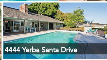
4444 Yerba Santa Drive