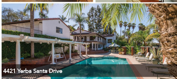
4421 Yerba Santa Drive