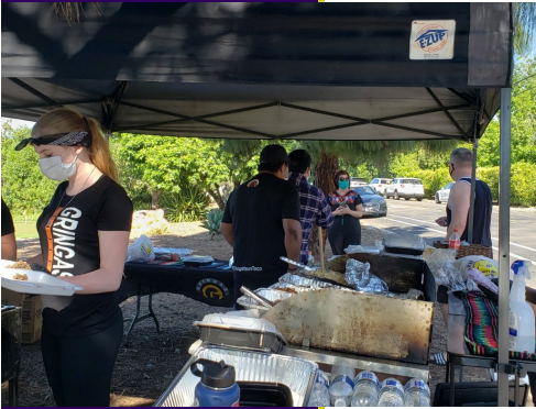
Gringas Tacos & Catering

The Social Committee was given a list of food trucks and went to work booking them for Tuesdays and Fridays in June. Wanting to have more and different food choices their latest new options were Beach EatZ with hamburgers, chicken & fish bowls and Born in Brooklyn with hot dogs, grilled cheese & hero/sub sandwiches.