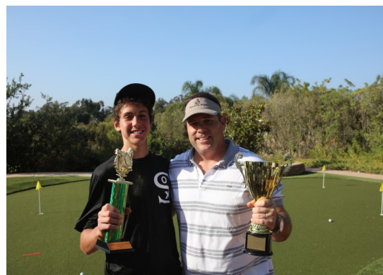
And the Winners Are!